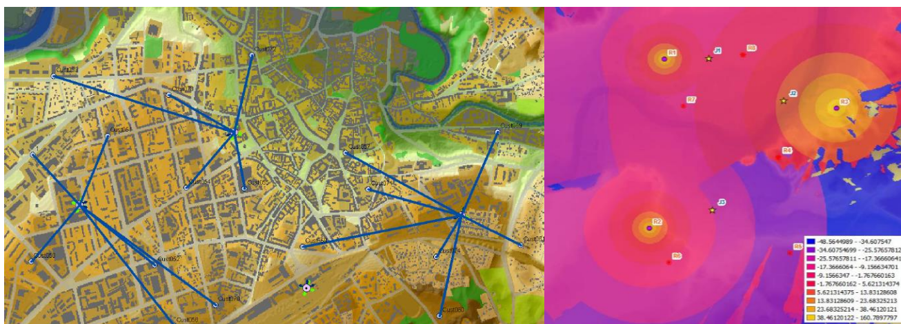
Automated Frequency planning for microwave network

To secure reliable mobile communications is one of the most important tasks for defense organizations. Besides, most often these companies implement on-the-fly and short-term projects, so any decision should be taken very fast and precisely. Therefore, defense organizations should always consider effective wireless network planning tool. Cellular Expert is the best choice in this case. It provides means for planning network very fast, precisely and solves very specific tasks taking into consideration 3D geographical data (terrain, clutter, and obstacles such as mountains, trees, buildings, etc.) Our defense clients worldwide use Cellular Expert to assess link performance and availability for point-to-point and point-to-multipoint connections. They also analyze optical and radio visibility and network coverage. Defense clients always need tools for fast planning and deployment, so according to customers' need Automatic Frequency Planning (AFP) for point-to-point networks has been developed as well as tools for optimal site location.